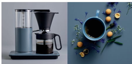
Wilfa CLASSIC longyear · CMC-100BL