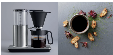
Wilfa CLASSIC silver · CMC-100S