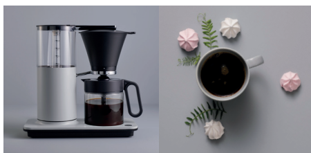
Wilfa CLASSIC copenhagen · CMC-100G

Using filter-ground coffee, Wilfa CLASSIC will brew a full jug in 4 to 6 minutes, and maintains a temperature between 92-96°C throughout the entire brewing process. This is the perfect extraction time for achieving optimal coffee flavour.